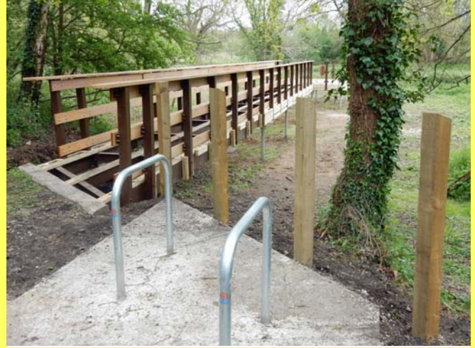
Compasses culvert (left) and viewing platform (right).

newer type which have four internal splines. This reduces the likelihood of the splines shearing, making the screws unusable.