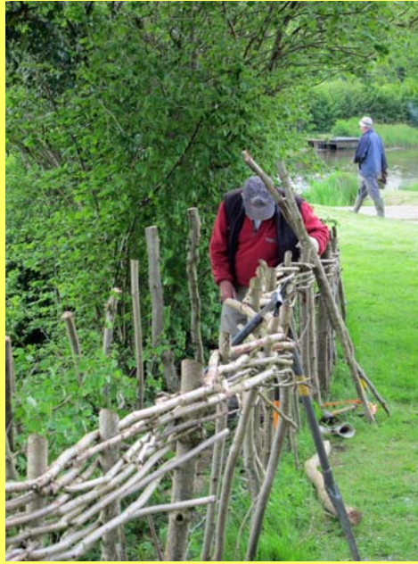
Pictures: Hedgelaying group at Roger Dimmock Lane and Drungewick slipways