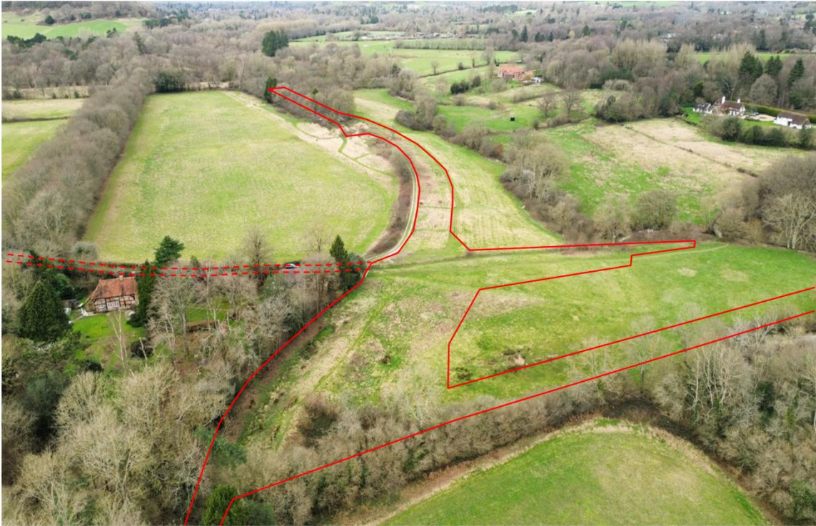
Aerial Photograph (Red lines are boundaries of approved planning application)