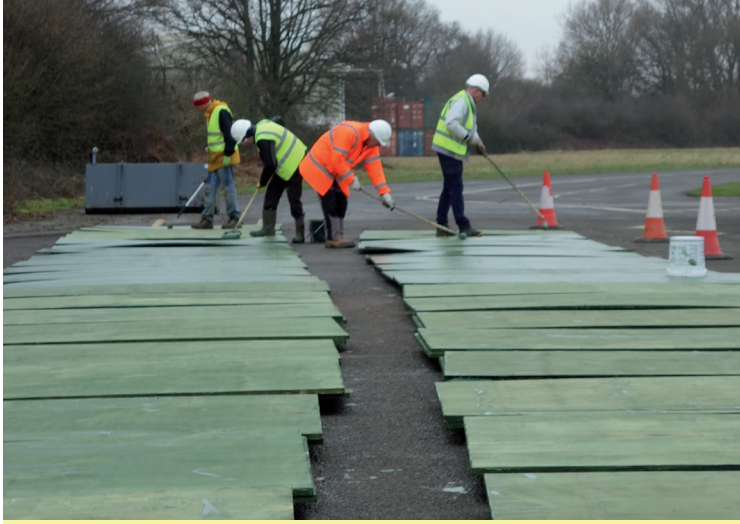
Volunteers paint screening in preparation for the construction of a road crossing at Tickner's Heath, Cranleigh.

A new access gate has been installed and a start has been made on installing land drains (as the site is on clay and retains water quite happily). The first stage of main construction will take place later this year (depending on coronavirus restrictions and planning requirements), commencing with a temporary diversion of the road to enable the installation of a footbridge.