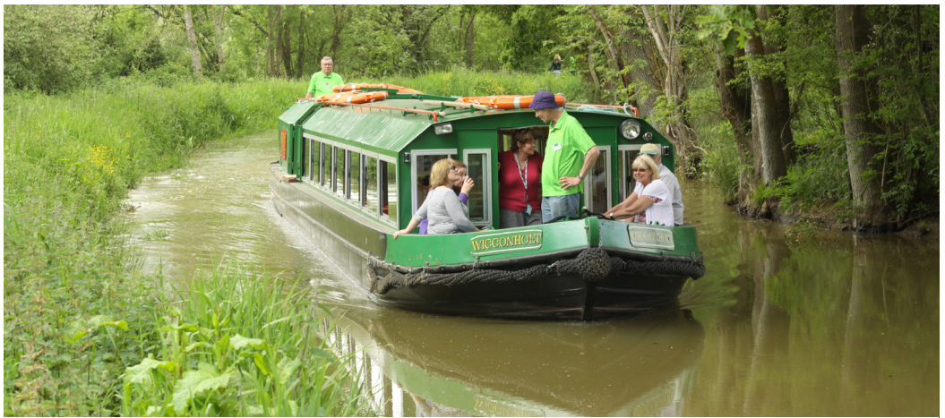
The Trust's trip boat Wiggonholt between Loxwood Lock and Devil's Hole Lock