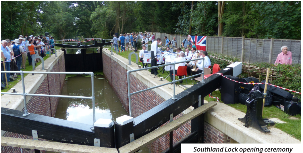
Southland Lock opening ceremony

If you have enjoyed this canal walk, why not try another? Please pick up a leaflet from our Loxwood Canal Centre or our Shalford Information Point or download from our website.