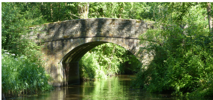
Barnsill Bridge - the first restored bridge on the Loxwood section

If you have enjoyed this canal walk, why not try another? Please pick up a leaflet from our Loxwood Canal Centre or our Shalford Information Point or download from our website.