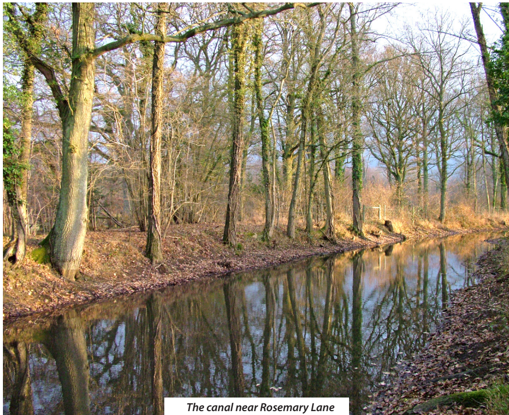
The canal near Rosemary Lane

village by the Village Shop/Post Office (G). From the shop turn right, crossing to the other side of the road to continue on down the pavement, soon to reach the Onslow Arms public house and the Canal Centre.