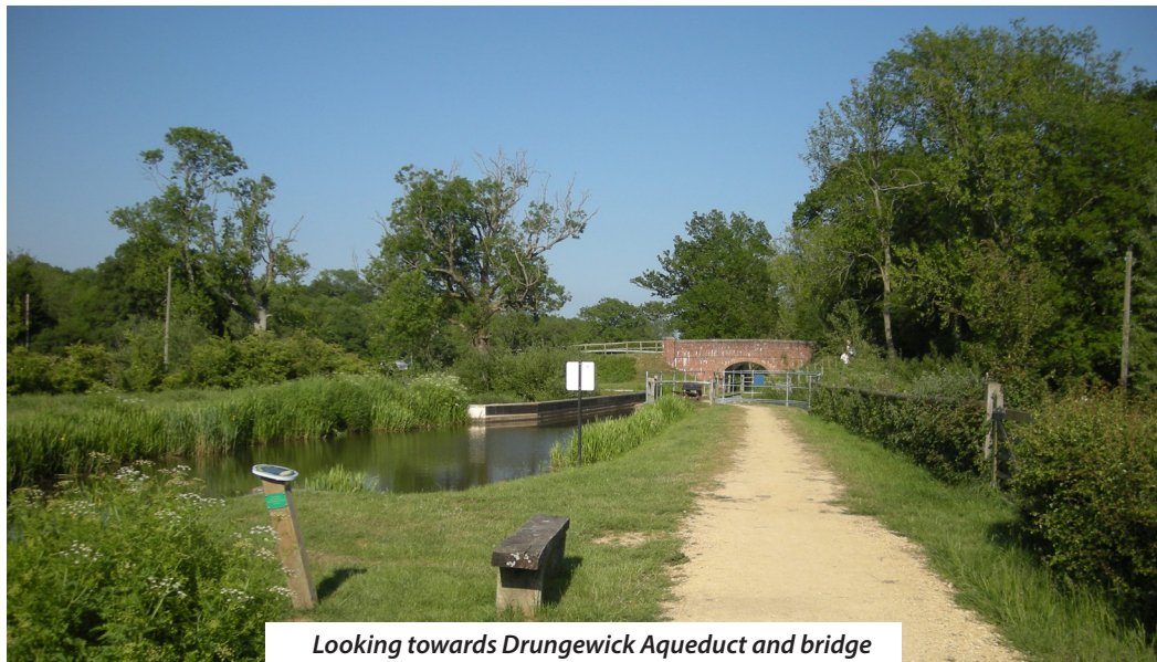
Looking towards Drungewick Aqueduct and bridge

Continue for just over 1½ miles along the canal towpath to reach the Canal Centre and the Onslow Arms public house.