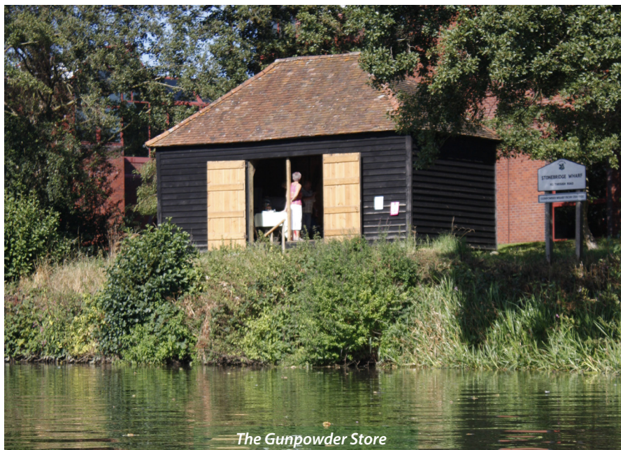
The Gunpowder Store

Follow the route of the old railway to cross a bridge over the River Wey (C). Immediately after the bridge (installed in 2006), go down the steps to the River Wey towpath. Turn left on the towpath to walk past the The Gun's Mouth (the start of the Wey & Arun Canal) and the Gunpowder Store. At Broadford Road (D), carefully cross the bridge to follow the opposite bank back to the Gunpowder Store and the end of the walk.