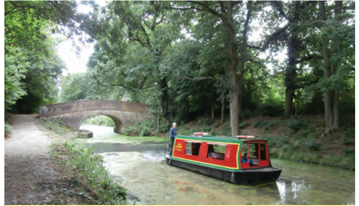
The Canal Trust's trip boat John Smallpeice is seen carrying passengers near Alfold in the Summer of 2013.

In September 1816, a ceremony at the Three Compasses in Alfold marked the official opening of the Wey & Arun Canal and a procession of barges set off towards Guildford. At the Three Compasses, a causeway currently blocks the canal to navigation. On one side of the causeway (towards Guildford), the canal route is navigable and saw