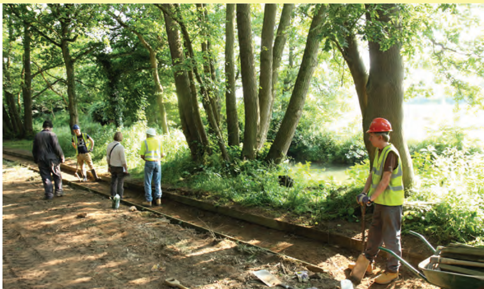
Volunteers work on the improved path with the Cranleigh Waters in the background.

The path is already proving very popular with local residents and walkers as a more peaceful alternative to the route along the old Guildford-Horsham railway. This is part of the National Cycle Network (route 22 from London to Portsmouth) and is heavily used by fast-moving cyclists.