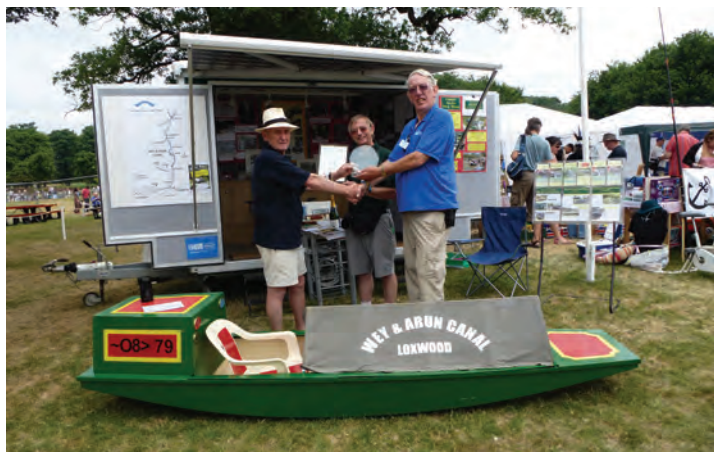
Canal Trust representatives receive the award.

A grant from Surrey Archaeological Society helped to fund the “mini-dig”.