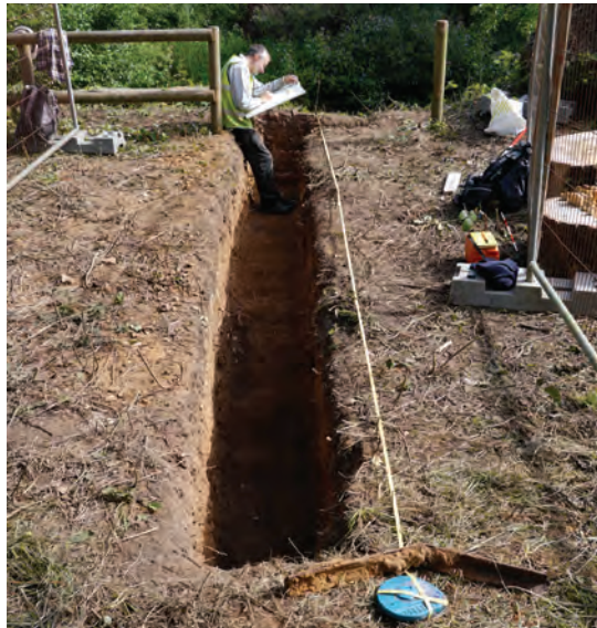
The Trust's consultant archaeologist records the results of the excavation at Gosden Aqueduct.

public boat trips during 2012 and 2013. Once the desilting work is complete, boats will also be able to use the section on the other side (towards Sussex and Loxwood). The Trust is making good progress with plans to replace the causeway so that the two sections are once again linked by water and boat trips will be possible along an attractive wooded section of about 2km.