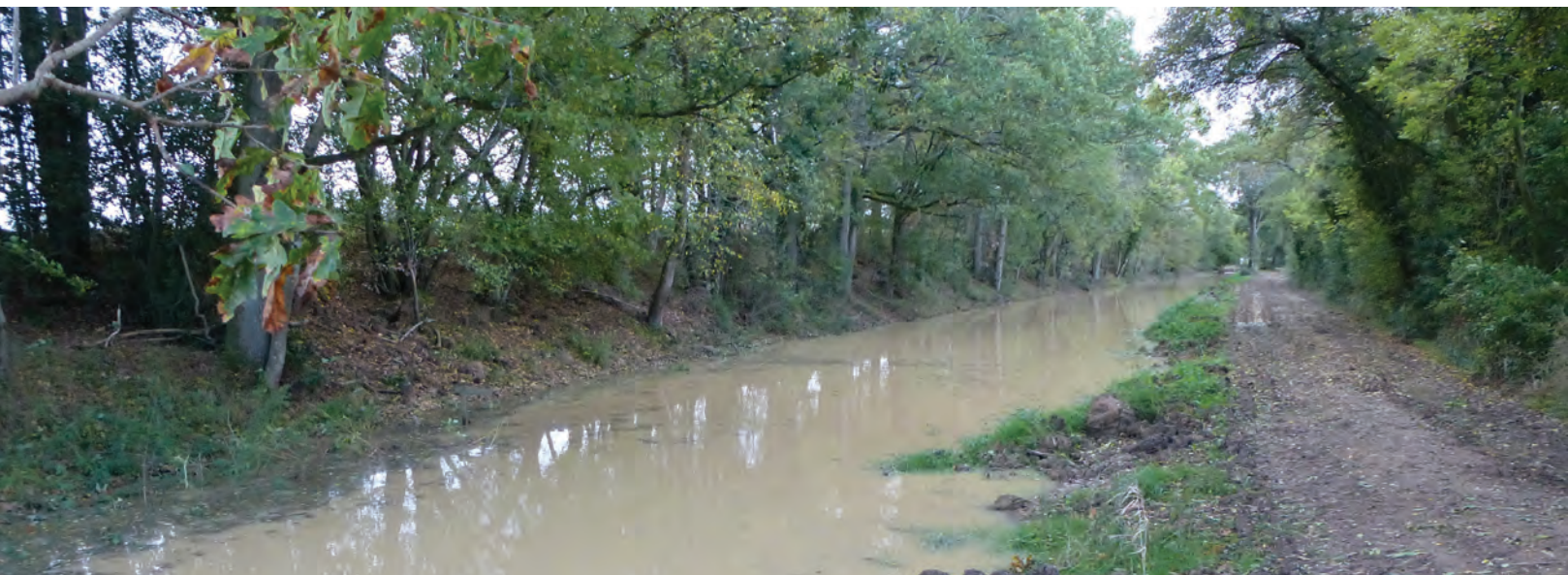
The section of canal between Devil's Hole Lock and Southland Lock, near Loxwood and Ifold, after heavy rain in October.

Now the appeal to members and supporters has progressed so well that the Trust expects contractors to install the concrete shell of the new Gennets Bridge Lock early in 2014. When this work has finished, volunteers will undertake the long list of tasks needed to complete the new lock, including facing the concrete shell with locally-made bricks. This is the same approach as the Trust successfully used at Southland Lock, slightly further south towards Loxwood. Work is now in progress to prepare the section of canal between Devil's Hole Lock and Southland Lock for use by the Trust's trip boats. Just north of Southland Lock, Chichester District Council has granted planning permission for a swingbridge to replace a causeway that currently blocks the canal route.