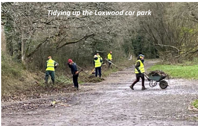
Tidying up the Loxwood car park

As anticipated in the last issue of WPN, the Group spent the last two meetings in November hedge cut-