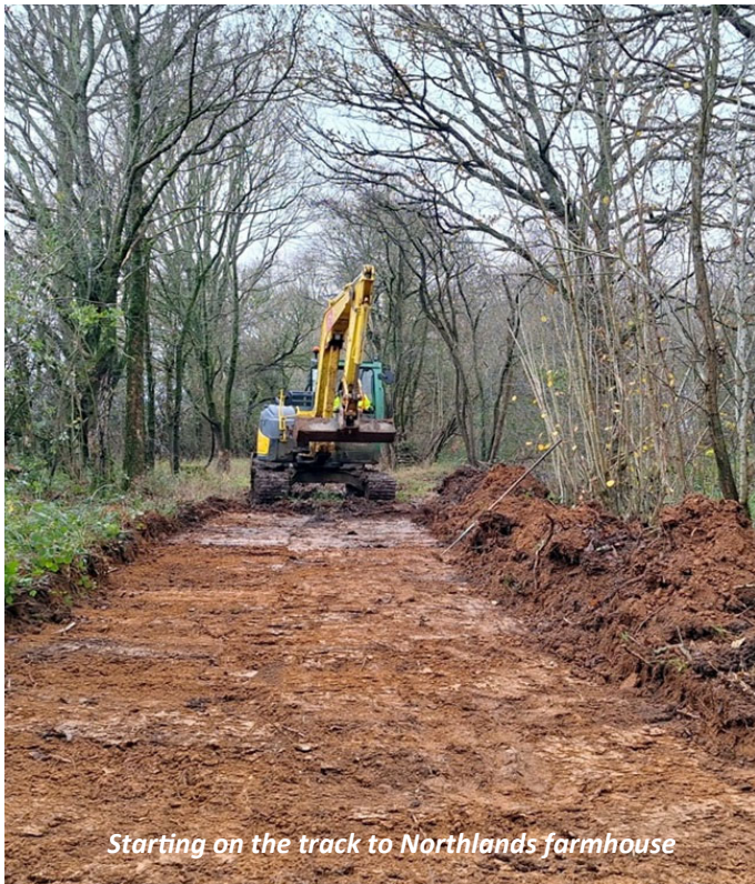
Starting on the track to Northlands farmhouse

first was cast in December and the second will be made in the New Year. In addition we have gone back to the suppliers of the hydraulic mechanisms for improvements.