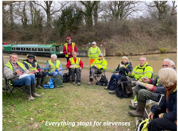
Everything stops for elevenses