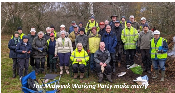
The Midweek Working Party make merry

The middle week was at Run Common Road where we do an annual clearance. We always make it a