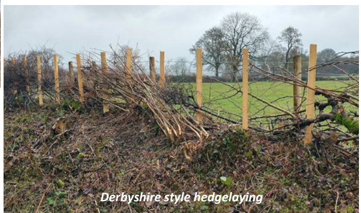
Derbyshire style hedgelaying

No photos from our work this month, but an image of another regional style in Derbyshire, which I came across in December - very different from what we do - square sawn stakes, spaced farther apart and no binding. Great to see regional differences!