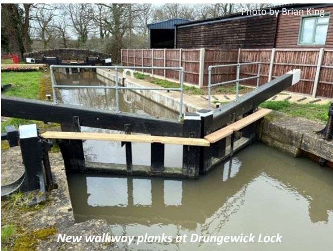
New walkway planks at Drungewick Lock

Whilst we were doing this, some of the team took May Upton to Drungewick Lock to fit the new walkway planks, which we had prepared last month, to the upper gates.