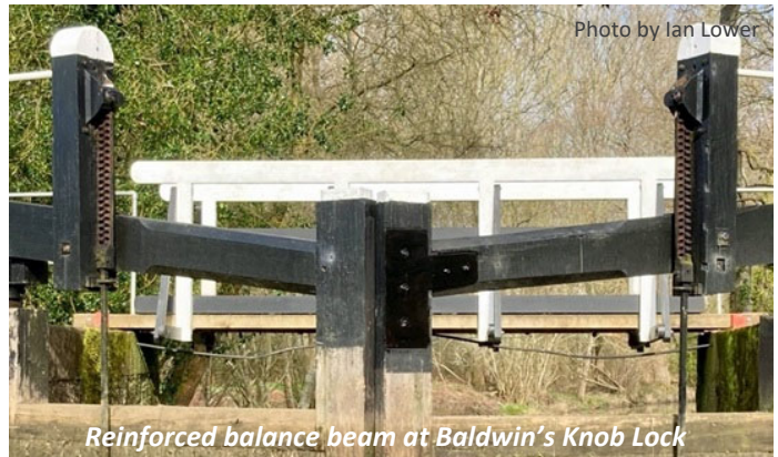
Reinforced balance beam at Baldwin's Knob Lock

Aqueduct and removed the stop planks to enable us to recover May Upton . We then replaced the stop planks (hopefully for the last time, for a while!) and returned May Upton to her mooring at the Canal Centre. En route we did yet more bankside clearance in the Barnsill Bridge area.