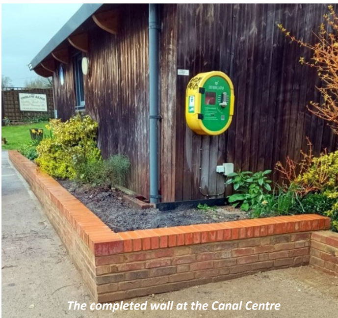
The completed wall at the Canal Centre

By the end of the month, the wall was completed. We cleared the area outside the Canal Centre as much as possible for the Easter weekend and it is all looking much tidier.