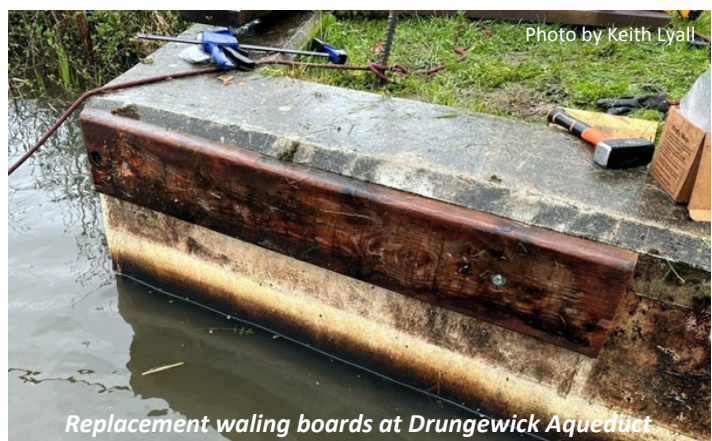
Replacement waling boards at Drungewick Aqueduct

On another fine March day, after some quick repairs to the signage outside the Canal Centre, we took May Upton to Baldwin's Knob Lock. The joint at the end of the balance beam on one of the lock gates had become loose and required reinforcement. Two customised steel plates had been made at Ticker's Depot and we clamped them either side of the joint, making the structure much more stable.