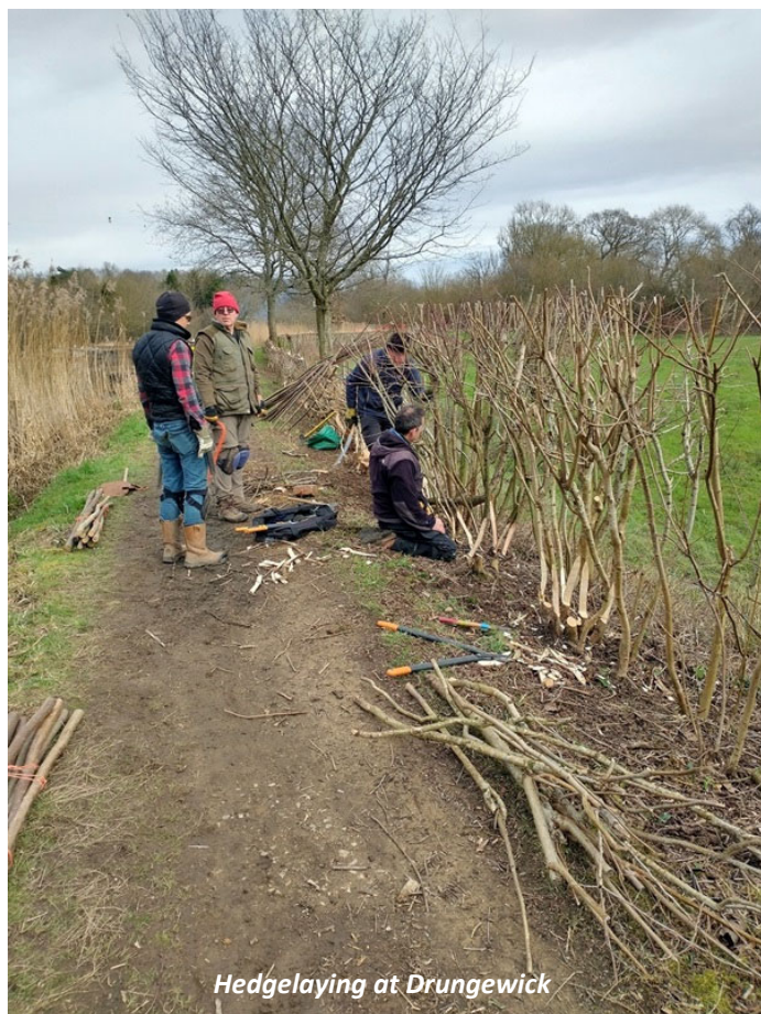
Hedgelaying at Drungewick

over the years, trapping even more dead material in the hedge. This has meant that preparation has taken even longer than usual. Hedgelaying is like decorating a house - there is always more preparation than actual painting or, in this case, laying. With 150 metres completed this season, there is still a further 270 metres of hedge to lay. At least we know what lies in store next season!