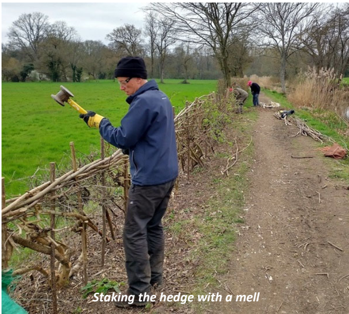
Staking the hedge with a mallet

over the years, trapping even more dead material in the hedge. This has meant that preparation has taken even longer than usual. Hedgelaying is like decorating a house - there is always more preparation than actual painting or, in this case, laying. With 150 metres completed this season, there is still a further 270 metres of hedge to lay. At least we know what lies in store next season!