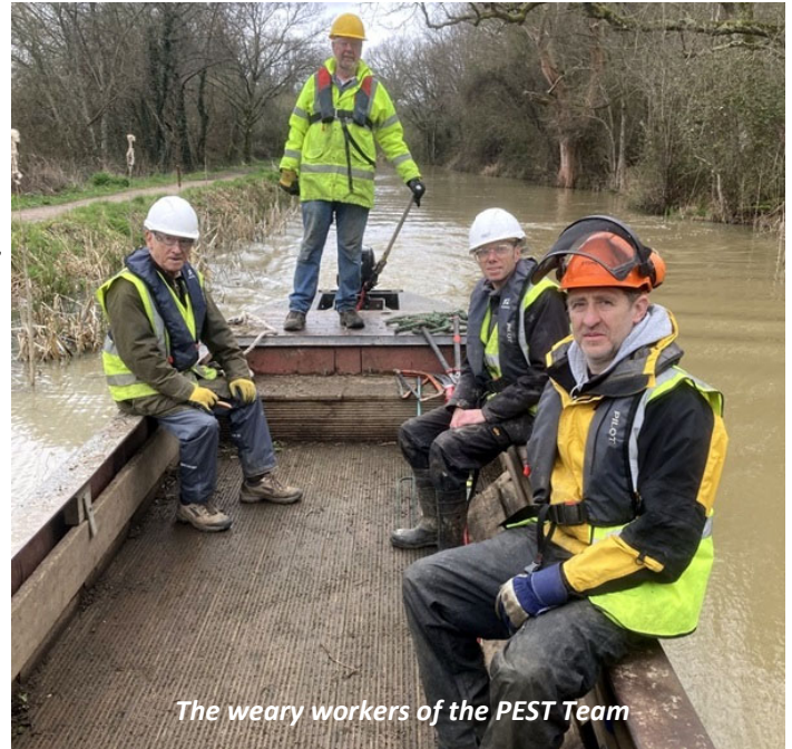
The weary workers of the PEST Team