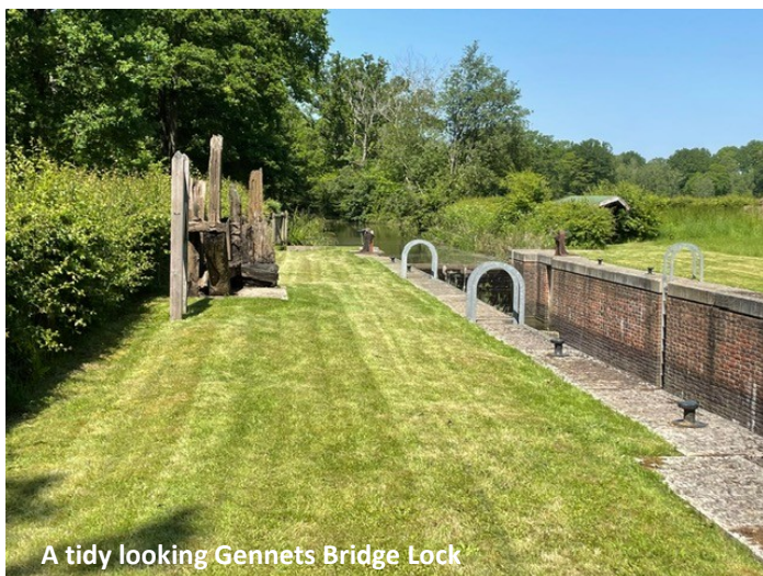
A tidy looking Gennets Bridge Lock

Although two bank holidays in May meant that the Group were only out twice, the visits replicated those in April. As we mentioned in the last WPN, every site requires a visit at least every other week now that we are into the 'full growing period' of the year. Accordingly, we visited Three Compasses, Tickner's (roadside and bridge), Gennets, Southland, Devil's Hole, Loxwood (lock & centre), Brewhurst, Baldwin's Knob and the Drungewick Aqueduct site.