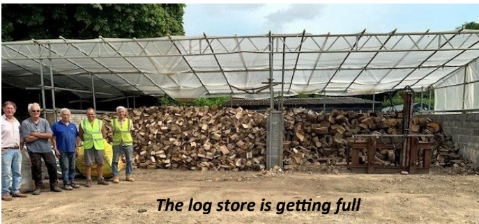
The log store is getting full

In the space of two weeks, one warm but damp underfoot and one of sub-Saharan temperature, we got the majority of them moved, split and stacked. These bays are 28 square metres each and two metres high – that's a lot of logs, and there's still 5 or 6 tons to split.