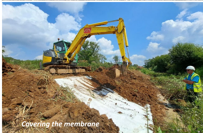
Covering the membrane