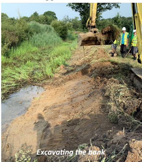
Excavating the bank

We did extensive work sealing areas of the bank with Bentomat membrane back in September 2021. However, further leaks have developed since then and most appeared to be in the vicinity of a number