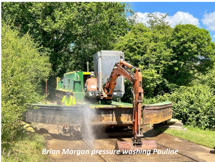
Brian Morgan pressure washing Pauline

The aft bilge area has been cleaned of rust flakes; filling four buckets!