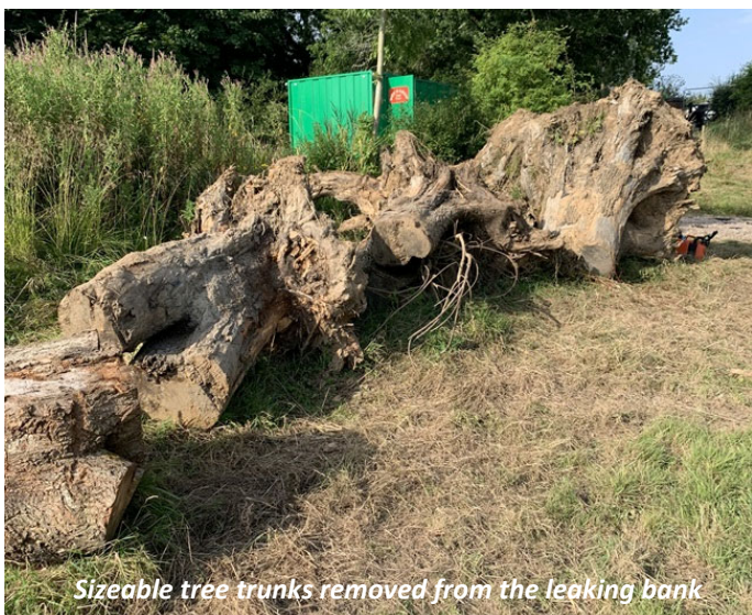
Sizeable tree trunks removed from the leaking bank

We did extensive work sealing areas of the bank with Bentomat membrane back in September 2021. However, further leaks have developed since then and most appeared to be in the vicinity of a number