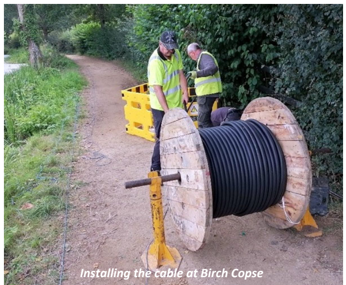
Installing the cable at Birch Copse

With there being a volunteer summer camp at Bonfire Hanger, we joined them on one of their days