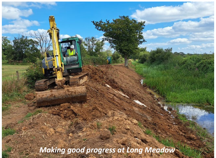
Making good progress at Long Meadow

The team has been operating at two sites during August. At the beginning and end of the month, we worked at Long Meadow making good progress on laying the Terraseal membrane on the bank to prevent further leaks into the adjacent field.