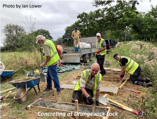
Concreting at Drungewick Lock

plank shelter at Drungewick Lock, we started preparing the site by levelling the ground and laying three concrete slabs to support the structure.