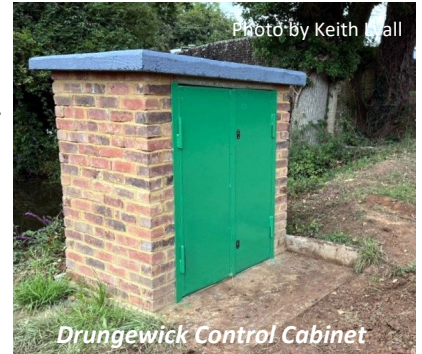
Drungewick Control Cabinet

The month started with a return visit to Drungewick Lock where half the group completed the brick cabinet by fitting the door panels and locks, painting the doors and finishing the concrete roof with a coat of acrylic sealant. The electrical work has been completed and we were able to backfill the trenches