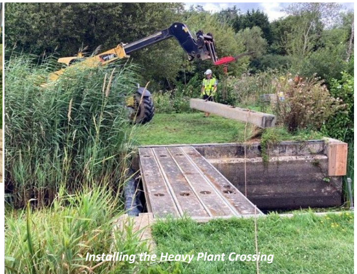
Installing the Heavy Plant Crossing