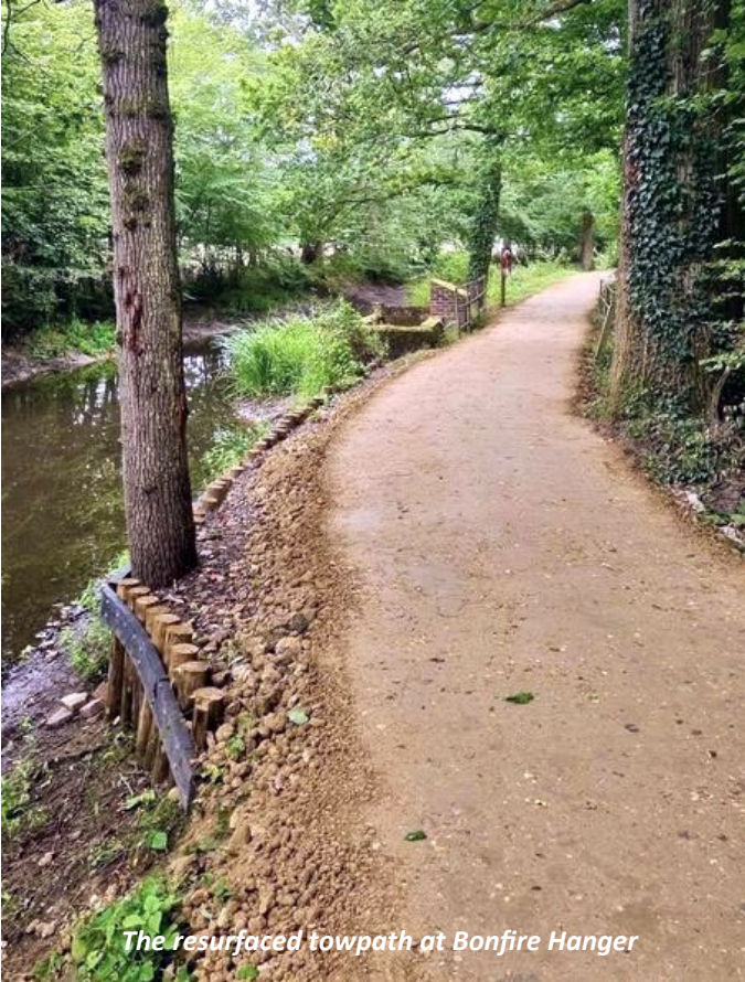
The resurfaced towpath at Bonfire Hanger

It's been a busy month for our volunteer teams on the canal. Fortunately the weather has been kind so good progress has been made.