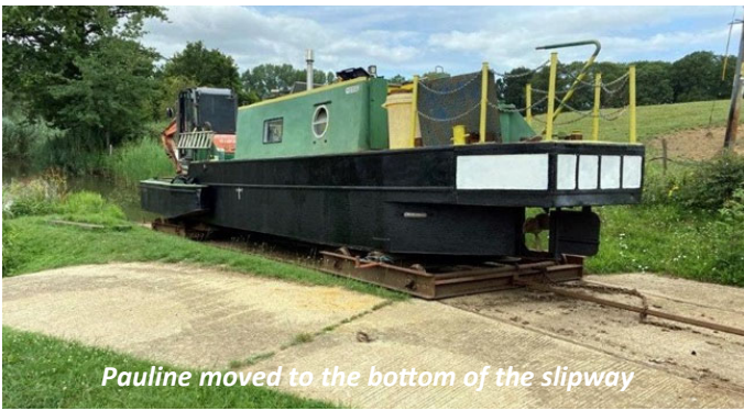
Pauline moved to the bottom of the slipway