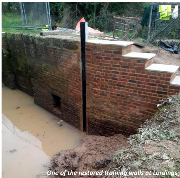
One of the restored training walls at Lordings

ings Lock and have made a good start on clearing the site ready for the winter. The lock itself remains to be excavated but that can wait until the spring.