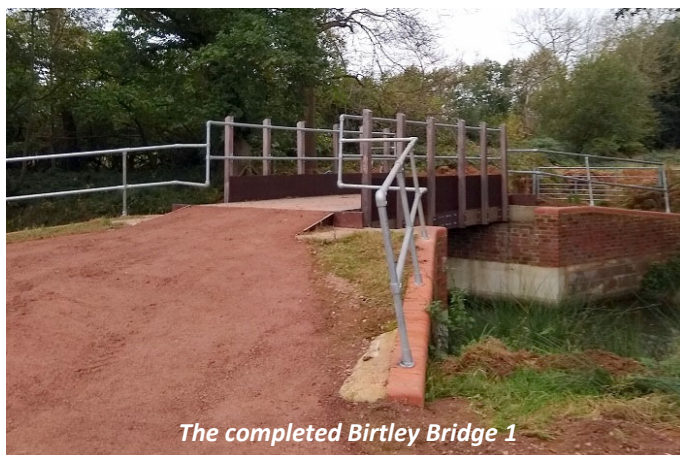
The completed Birtley Bridge 1

At Tickner's work has continued to achieve completion of the bridge approach forebay and walls before winter sets in. In this aim we have been doing well! At the beginning of the month, the shuttering having been removed, the scaffolding was re-erected to allow the brickies to start work on the brick facing above the waterline. About eight courses were completed by the end of the month. Additional brickwork is also being progressed on the southern footbridge abutment to accommodate the water main that crosses the bridge in a slightly different position than had been envisaged!