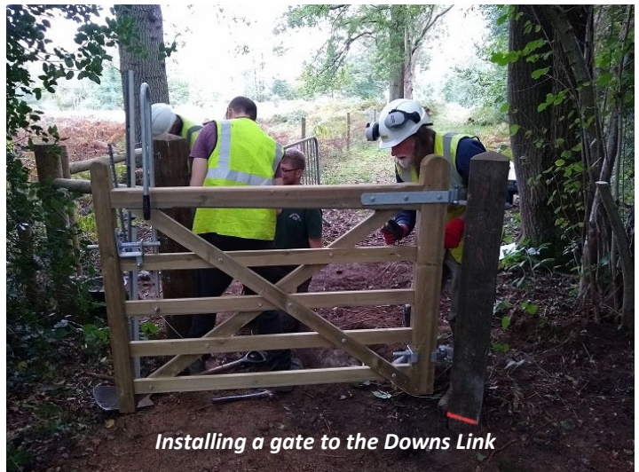
Installing a gate to the Downs Link

London Waterway Recovery Group joined us for two days at the end of the month. Their team erected the tricky curved shuttering formwork that will enable the last section of wall on the north side of the forebay to be poured. They also cut back a couple of trees, continued with the brickwork and assisted with the temporary road excavation works.