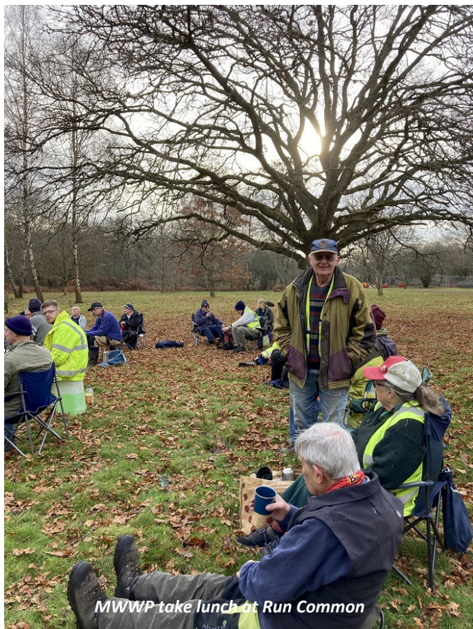
MWWP take lunch at Run Common

Hunt Park is consuming a great deal of time for a small group. At the Shalford Information Centre, a new fence has been erected from the corner of the boardwalk to the river to prevent the public and dogs wandering on the area until such time as the conservation plan agreed with our ecologists has been completed.