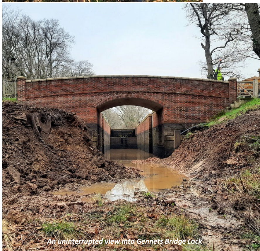
An uninterrupted view into Gennets Bridge Lock