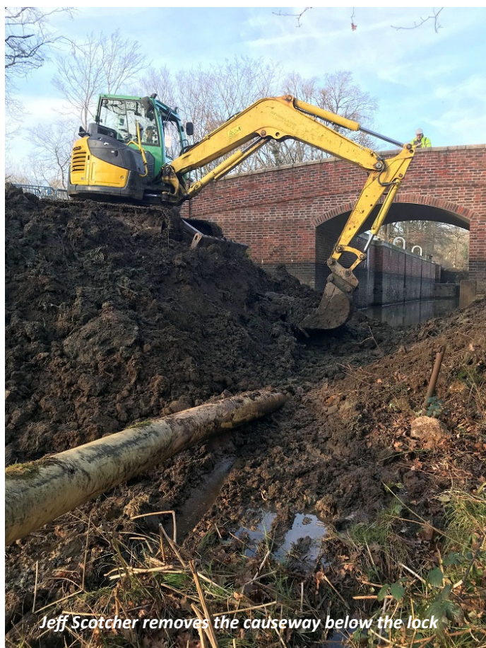
Jeff Scotcher removes the causeway below the lock

Notably, the old causeway below Gennets Bridge Lock