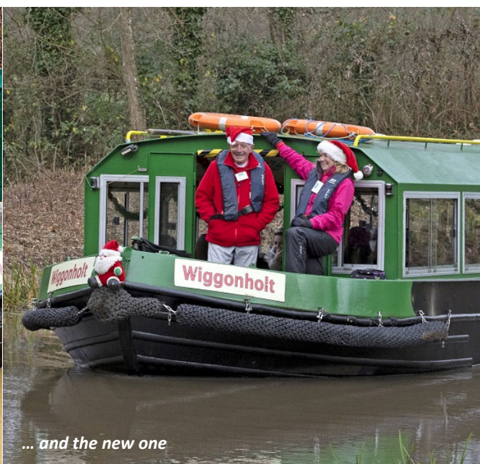
... and the new one