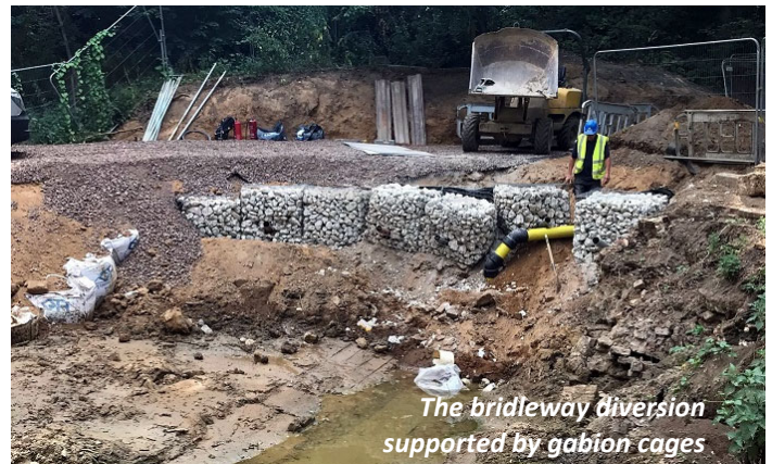
The brideway diversion supported by gabion cages