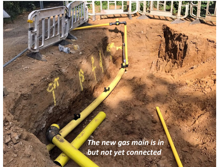
The new gas main is in but not yet connected

Meanwhile the EWG team have progressed the bridle-