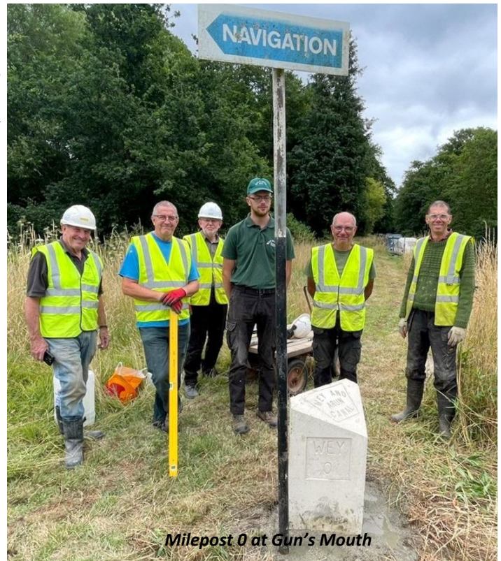
Milepost 0 at Gun’s Mouth