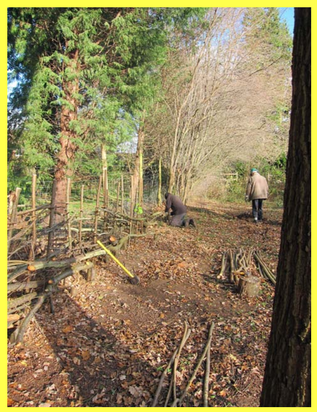
Carrying on regardless

So, I am writing this in my mobile office which is not in Horsham and definitely not in the Anchor Tap. Shock! Horror! I've given up drinking beer! Well, until someone offers to buy me a pint. Sorry, I've got bored with waiting so I'm off to the bar.