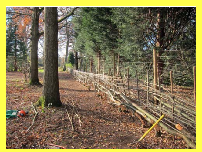
This year's laying with last year's in the distance