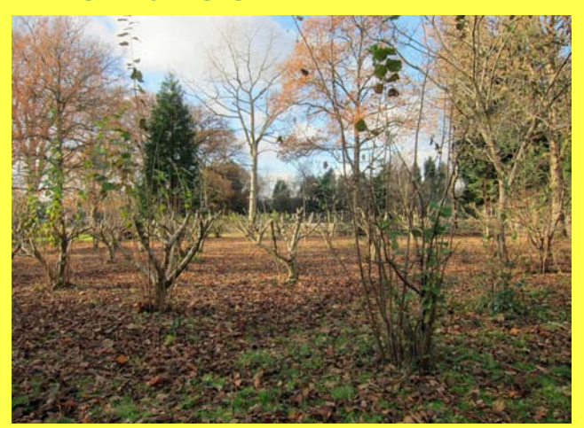
Pollarded hazels with hedge in background