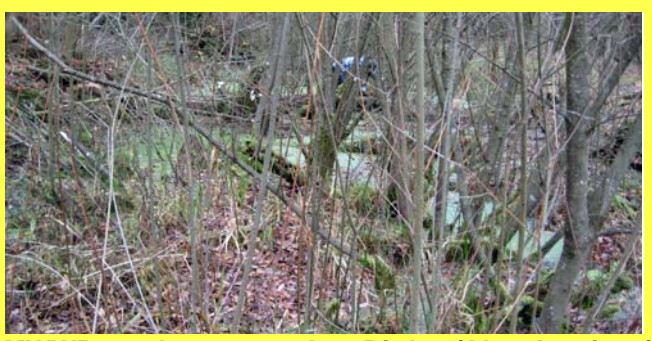
MWWP get down to work at Birtley