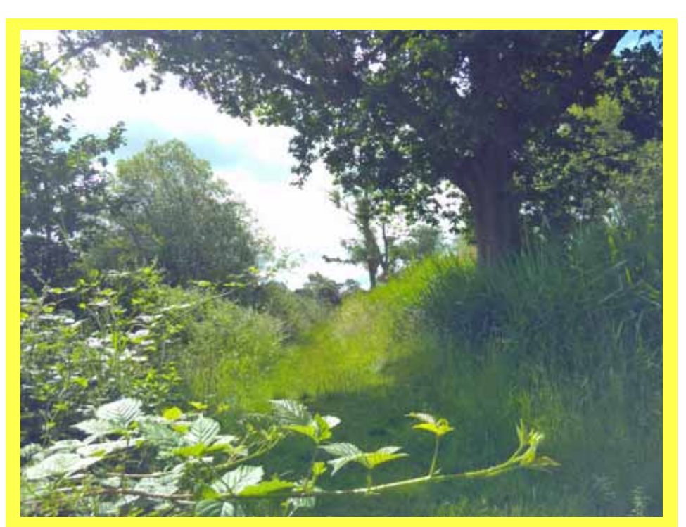
Path at Drungewick before Monday Group's attention