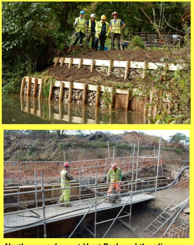
Northern workers at Hunt Park and the slipway

19.30 the previous evening and had about five minutes to spare between completing the frame and the arrival of the concrete. The pour went smoothly and the results will be revealed when the shuttering comes down in early November.