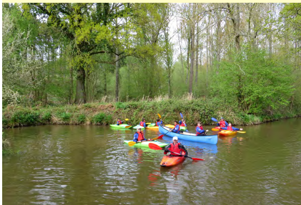
Below: Rudgwick Scouts, seen here in the winding hole below Baldwin's Knob Lock, are also regular visitors.