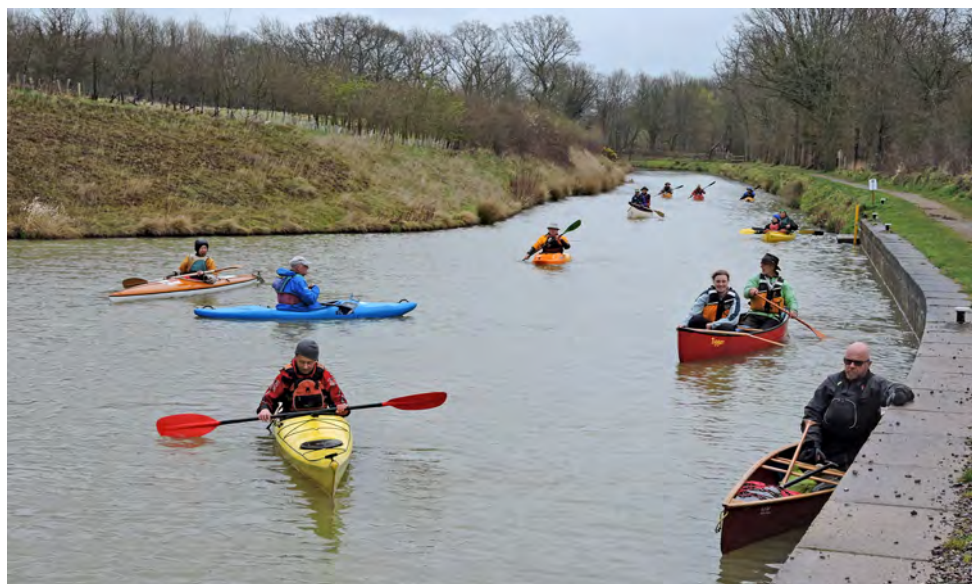
Above: Taking advantage of the Trust's recent agreement with British Canoeing, a large party visited the Loxwood section in late March.