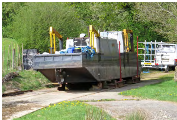
The Trust's dredger on Drungewick slipway.

Over the last few months some of the team have made two trips to foreign parts - one a fruitless trip to Newhaven to pick up the Mobile Display Vehicle (MDV) only to find that