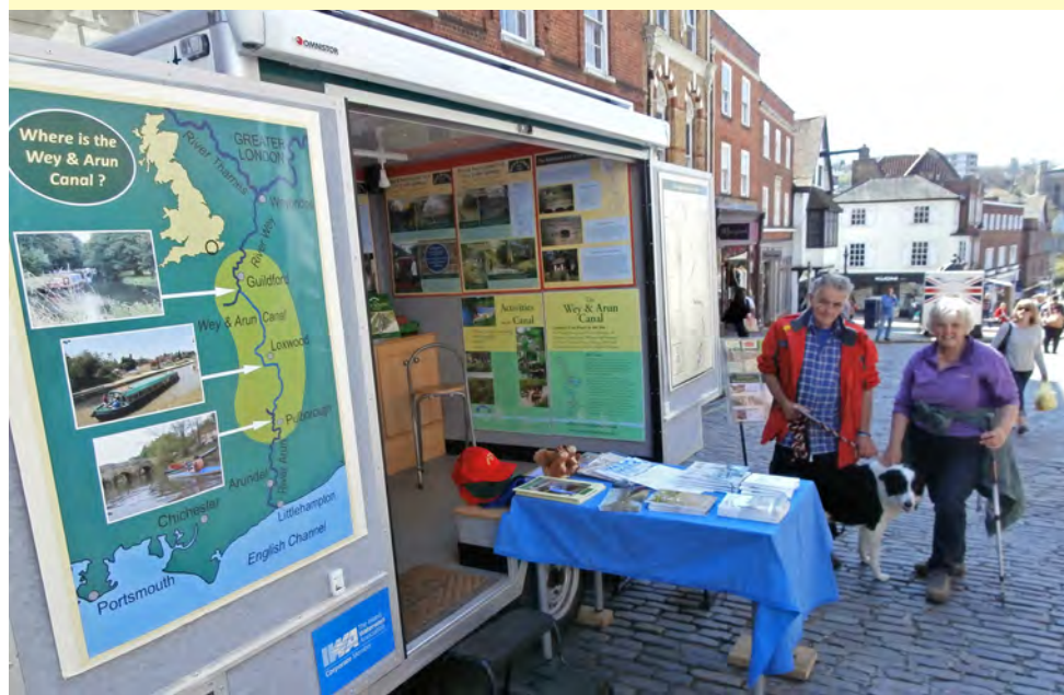
Below: The Trust's Mobile Display Vehicle, now seven years old, has recently undergone a works visit. In late April it was in Guildford High Street for the Farmers Market.