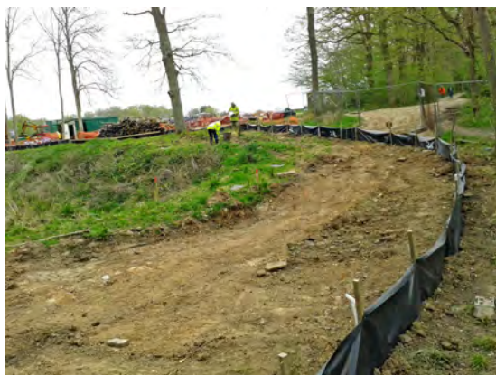
The special 'newt fencing' is on the right and the site of Gennets Bridge Lock is on the left.

At Gennets Bridge Lock (GBL) we received the European Protected Species licence on 9th April 2015. Work in that direction started in 2012! Training of the nine volunteers has been completed in what is to be done during the search period, which will last a minimum of 30 days. After the training each volunteer was given a letter of accreditation in case they are challenged by a police officer. A fence has been erected around the construction site and inside the fence there are 32 buckets and 50 pieces of roofing felt as refuges; these enable