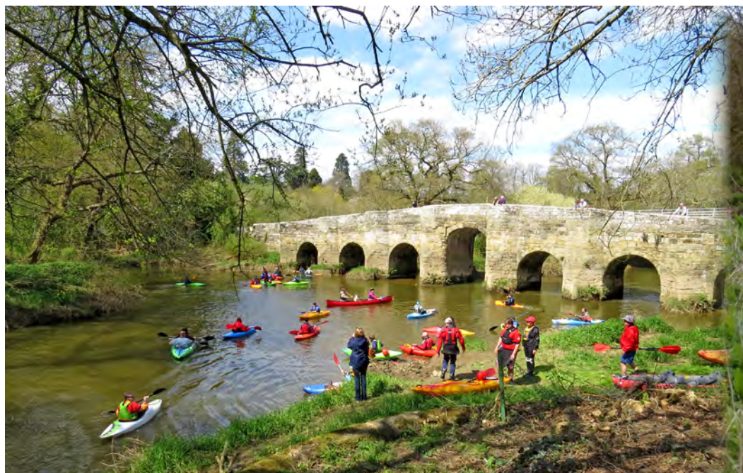
Above: in front of the historic Stopham Bridge (the centre arch was made higher to allow navigation). Below: Approaching Pallingham Farm - around two hours before high tide, most boats needed a tow upstream through the rapids.