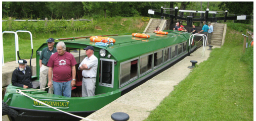
Wiggonholt is seen here in Brewhurst Lock