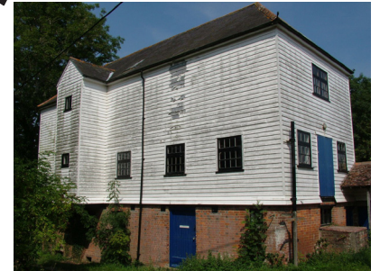
Brewhurst Mill was a working flour mill until the 1960s. It is now privately owned but is usually open to the public on Heritage Open Days in September.