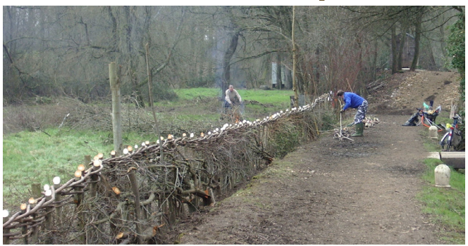
Look out along the towpath for the hedges laid by Canal Trust volunteers in the traditional Sussex style.

The total cost of the project was nearly £2 million, entirely raised by the Canal Trust.