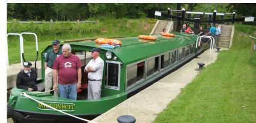
Wiggonholt is seen here in Brewhurst Lock