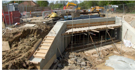
Loxwood Bridge under construction in early 2008.