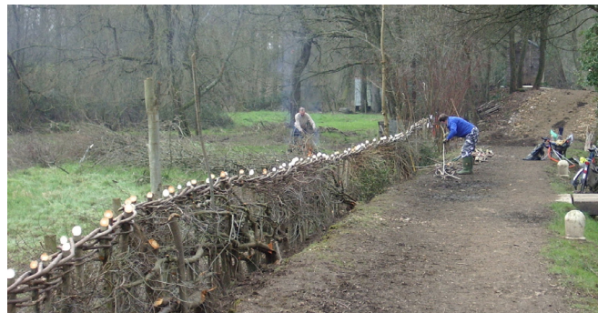
Look out along the towpath for the hedges laid by Canal Trust volunteers in the traditional Sussex style.