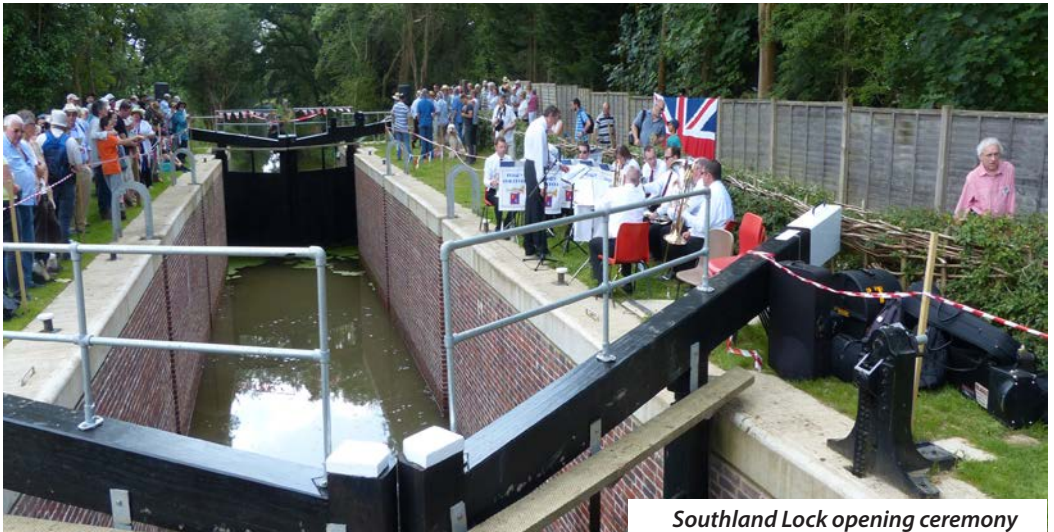
Southland Lock opening ceremony