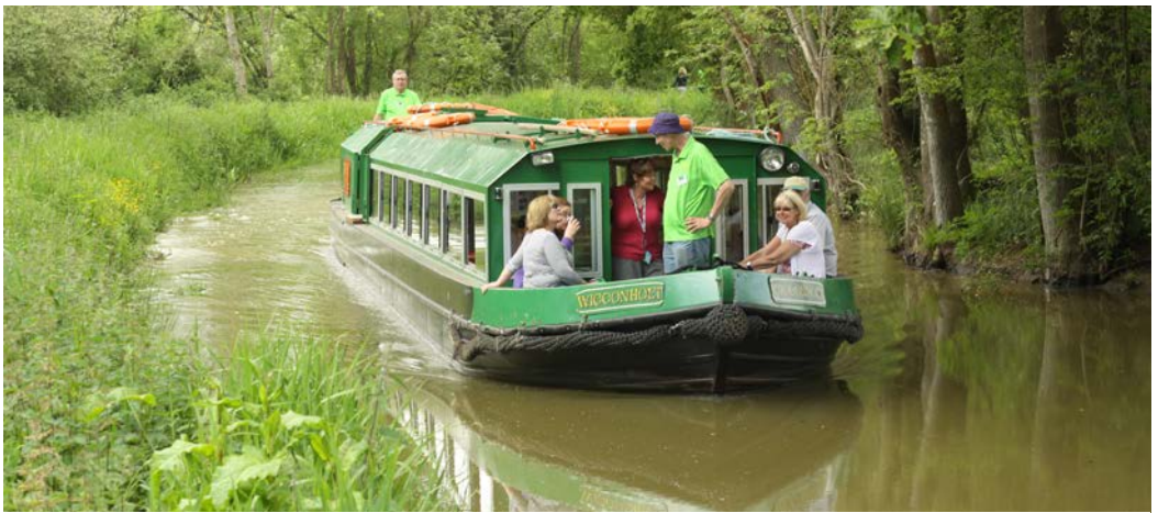
The Trust's trip boat Wiggonholt between Loxwood Lock and Devil's Hole Lock