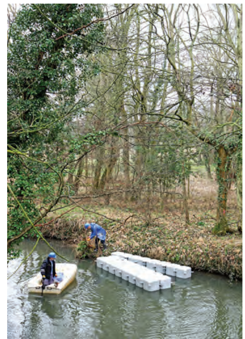
Volunteers at Gun's Mouth Island

Canal Trust members have responded generously to an appeal for funds to widen an existing channel alongside Gun's Mouth Island in Shalford, Surrey. The new channel will have sufficient depth and width for navigation by canal boats. It will form the northernmost section of the restored Wey & Arun Canal in Surrey. The Canal Trust hopes to carry out the work in early 2013.