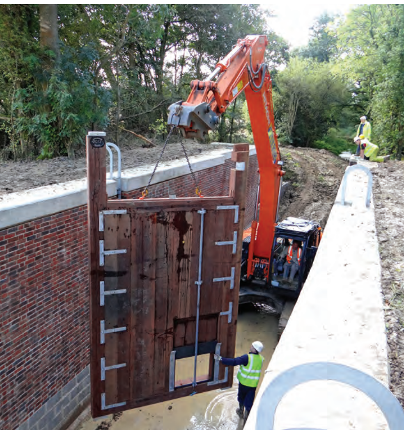
One of the new Southland Lock gates is lifted into position

The Canal Trust hopes to hold an official opening ceremony for Southland Lock in 2013, once the team has completed the lock and the section of canal southwards to Devil's Hole Lock (no. 6), has been restored to navigable condition. The volunteers will also turn their attention to the next lock northwards, Gennets Bridge (no. 8). Chichester District Council granted planning permission for rebuilding this lock in 2011.