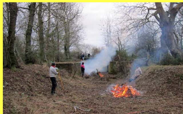
Coppicing and hedge laying