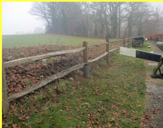
of the fence work undertaken by the Monday group at Devil's Hole Lock on a January day during somewhat inclement weather